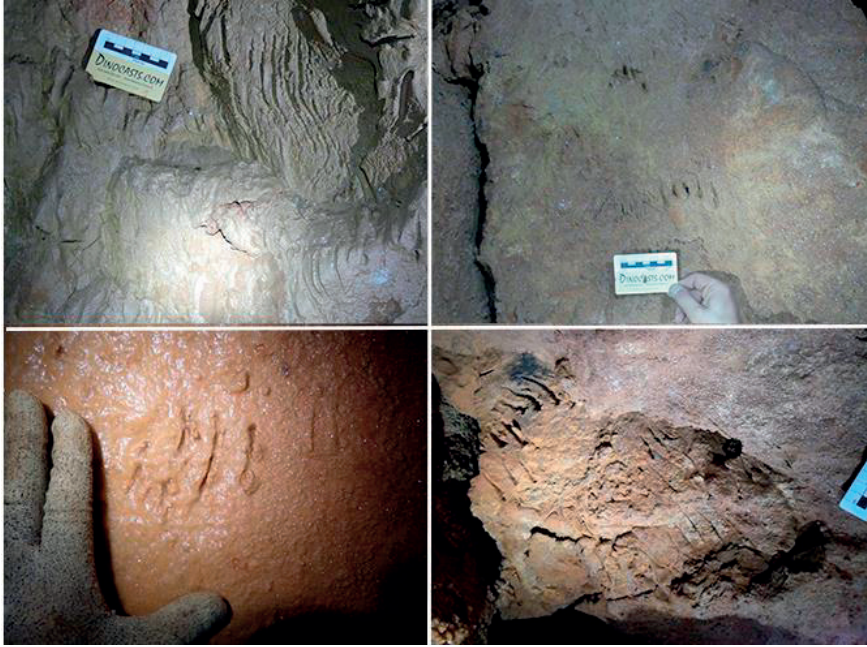
Figure 2: Bear claw marks in the walls of the Algar do Vale da Pena, Portugal. Scale bar is 7 cm.

Carvalho, 2018) and large hibernation beds made by bears have been observed and communicated to us by speleologist in the Almonda cave system.