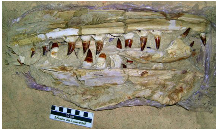
Fig. 11. Prognathodon sp. skull at Bentiaba (Photos by OM and Carlos Natário).