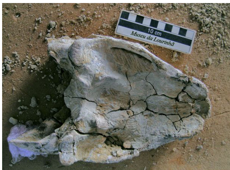
Fig. 8. Turtle skull from Iembe coast (4.5 km north of Tadi).

Chelonia —An apparently new taxon of turtle is represented by a nearly complete but fractured skull (Fig. 8) from near the Iembe Angolasaurus site. The specimen has not been fully prepared, but it appears to have a suite of derived and primitive characters, among others, divided nares, an extensive secondary palate, incisura columellae auris enclosing stapes, elongate squamosal processes, narrow interorbital