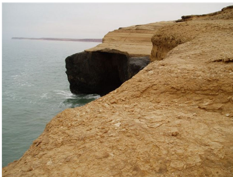
Fig. 5. Volcanic flow intercalated with late Cretaceous shallow marine sediments, north of Bentiaba.

Within the section, high-energy terrigenous conglomerates are interbedded with nearshore marine sands. The conglomerates can be traced laterally for extended distances, some at least, into more terrestrial channel and overbank facies associated with volcanics and evaporites (Fig. 7). The evaporites presumably were emplaced via post-Aptian salt tectonics as is also seen in offshore seismic sections. Neither the volcanics at Bentiaba or east of Fazenda dos Cavaleiros have been radiometrically dated.