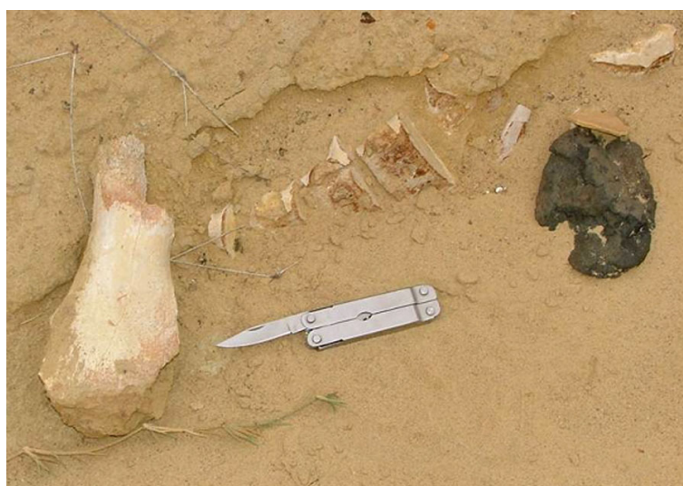
Fig. 9. In situ plesiosaur remains at Bentiaba.

More recently, Polcyn and Bell (2005; see also Bell and Polcyn, 2005) included Angolasaurus in their phylogenetic analysis. The matrix they employed was largely based on Bell (1997b), constructed for Adriatic and North American mosasaurs, but expanded somewhat. There is not total concordance of the taxa or characters utilized in the analyses of Polcyn and Bell as compared to that of Lingham-Soliar, and consequently, the hypotheses presented by those different authors are not strictly comparable. Specifically, according to Lingham-Soliar (1994), Prognathodon solvayi and Halisaurus ortliebi nest within the