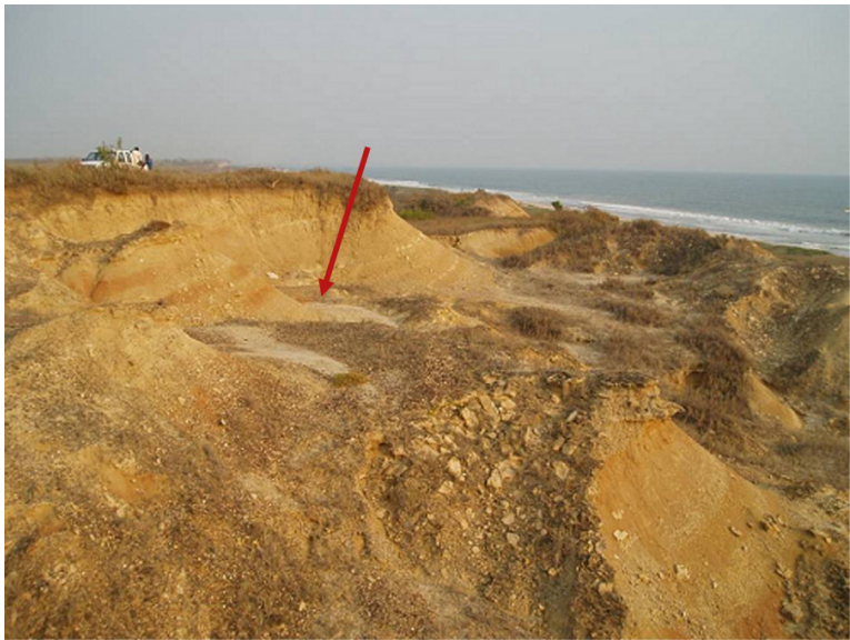
Fig. 3. Iembe, near Tadi, at or near the type locality of Angolasaurus bocagei and Tylosaurus iembeensis . The new skull of Angolasaurus was found (by O.M.) approximately at the arrow.