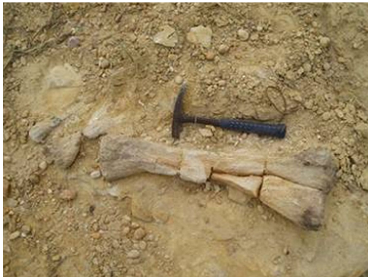
Fig. 12. Sauropod ulna and manus elements at Iembe near type locality of Angolasaurus.

Although the specimen was found in near shore marine sediments, the association of the bones and the terrigenous input into the strata indicates proximity to the paleoshoreline. Moreover, this specimen, found in sediments at or near the end of the Turonian, is probably the most precisely dated Cretaceous dinosaur in sub-Saharan Africa. The morphology of the ulna suggests that the forelimb does not belong to a titanosaurian (Mateus et al. , submitted).