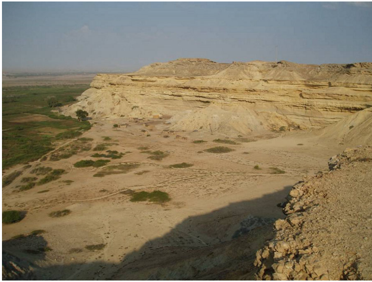
Fig. 6. Fazenda dos Cavaleiros. Cretaceous-Paleogene transition is about midway up the outcrop face.