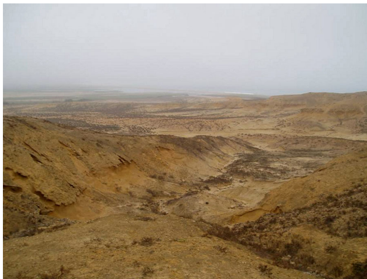
Fig. 4. Late Cretaceous (Campanian-Maastrichtian fide Antunes and Cappetta, 2002) beds of Bentiaba.