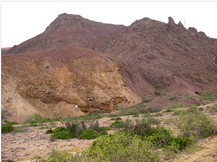
Fig. 7. Cretaceous terrestrial sediments with evaporites juxtaposed along igneous rocks in western Namibe Province.

ing evidence along much of the passive margin of coastal West Africa that marine facies grade into more terrestrial facies and that both are fossiliferous. From the Eocene of Togo, for instance, Gingerich et al. (1992) reported sharks, whales, and sirenians, as well as possible land mammals. In Cabinda, marine vertebrates have long been known from the Paleogene of Landana (e.g., most recently Schwarz, 2003) and terrestrial fossils have been recognized from Malembo, near Landana. Antunes (1964:plate 12:fig. 28) indicates a rhinoceros from Miocene strata near the coast of Angola. A similar marine-nonmarine facies