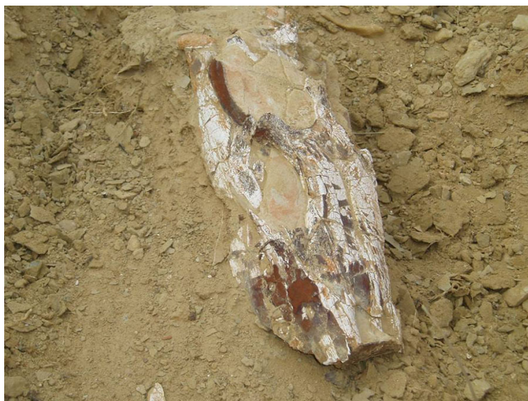
Fig. 10. New skull of Angolasaurus at Tadi.

Sauropoda —Arguably, the most important fossil found in the 2005 expedition is the articulated forelimb of a sauropod dinosaur (Fig. 12), because it is the first Cretaceous terrestrial vertebrate discovered in Angola and therefore opens the door to a new fossil field for African Cretaceous terrestrial biota.